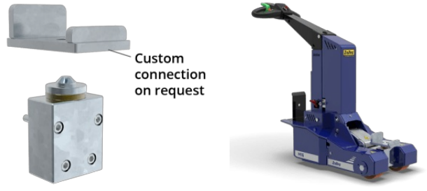
Rotating hitch with customizable connection