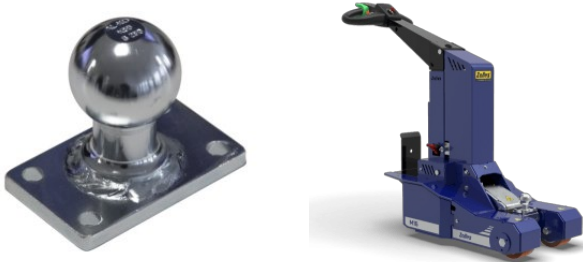
Tow ball hitch (upper block)