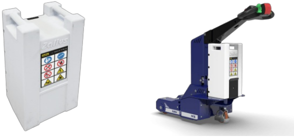
AGM battery pack - 37/45Ah