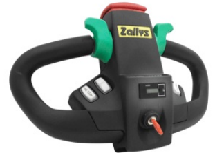
Digital hour meter