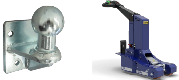
Tow ball hitch (frontal block)