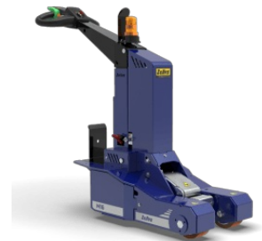
Support with flashing beacon